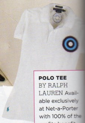
POLO TEE BY RALPH LAUREN Available exclusively at Net-a-Porter with 100% of the profits benefit- ing FTBC.

Californians can take virtual front-row seats at the runway shows in Milan, Paris and New York thanks to London-based e-tailer Net-a-Porter . Founded in 2000 by L.A.-born Natalie Massenet, a former W and Tatler fashion editor, the site reflects an influence from California's easy style and love affair with luxury. "I'm inspired by the variety of choice and level of service that is so prevalent in L.A. shops," says Massenet, "and valet parking is something we should have everywhere in the world to make life easier!" ¶ Known as the first online seller of designer fashion, Net-a-Porter is also on the forefront of charity: The site is heading a worldwide effort in support of Fashion Targets Breast Cancer (FTBC), an organization founded in 1994 by designer Ralph Lauren, establishing a shop of limited-edition designer items for exclusive sale. ¶